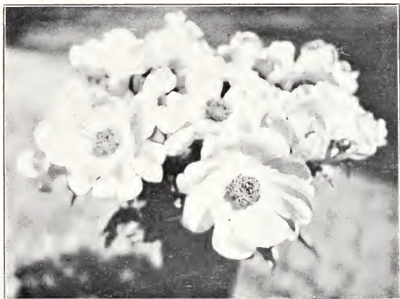
“Mischief” Auten, 1925

ALASKA —(1925) A very unusual shade of red, salmon I call it, with lighter shadings in center. Typical anemone bloom, delightfully rose fragrant, and it seems to meet the strictest commercial requirements as to substance and keeping qualities. Has attracted much attention both in the field and at exhibitions, and is entirely different in color from any peony now in commerce with which I am familiar. This is offered for those who desire something different in color and general effect. Stock extremely limited, and only four roots for sale this year.....$20.00 each